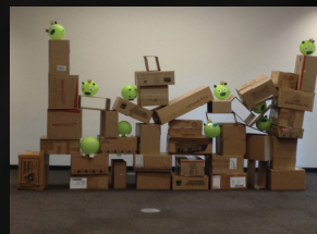
Live Angry Birds

2013 featured even more exciting new program choices for the community, including Facebook Me! Learn the Basics of Facebook ; Hunting and Fishing in the Peace ; Internet Basics for Job Seekers ; Swing